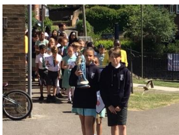
Learning and laughing together in the light of God's love.

In this Year of Hope, we looked not just at our community but communities, both locally and globally, who we could share our joy and faith with. With this in mind, our wonderful Reception pupils brought in donations of cut flowers, which were later donated to the local care home, Wray Common, who were extremely grateful for the simple but beautiful act of kindness. For Years 1-6, pupils were invited to donate the cost of a bouquet to Mary's Meals.