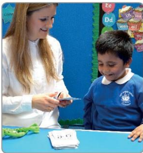
Learning the Speed Sounds in the classroom.