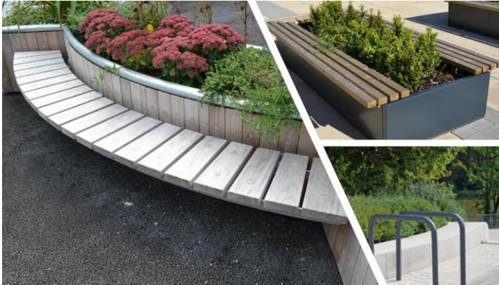
Examples of public space improvement designs

To facilitate a wider footway next to the zebra crossing the bus parking lay-by will be removed. Environmental enhancement measures will be introduced to create an improved public space for the benefit of all the community. Examples of possible features: